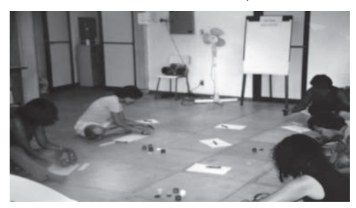
Picture 4- Creativity workshop for teachers in higher education. Digital collection of the first author<sup>4</sup>

care actions in various environments (parks, schools and health care network).