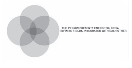
Picture 3- Schematic representation of the Science of Unitary Human Beings, Rogers, 1970<sup>3</sup>

The Picture 3 highlights the continuous interaction that one can achieve, modifying the ideas, actions and behaviors, according to the precepts of the SUHB.